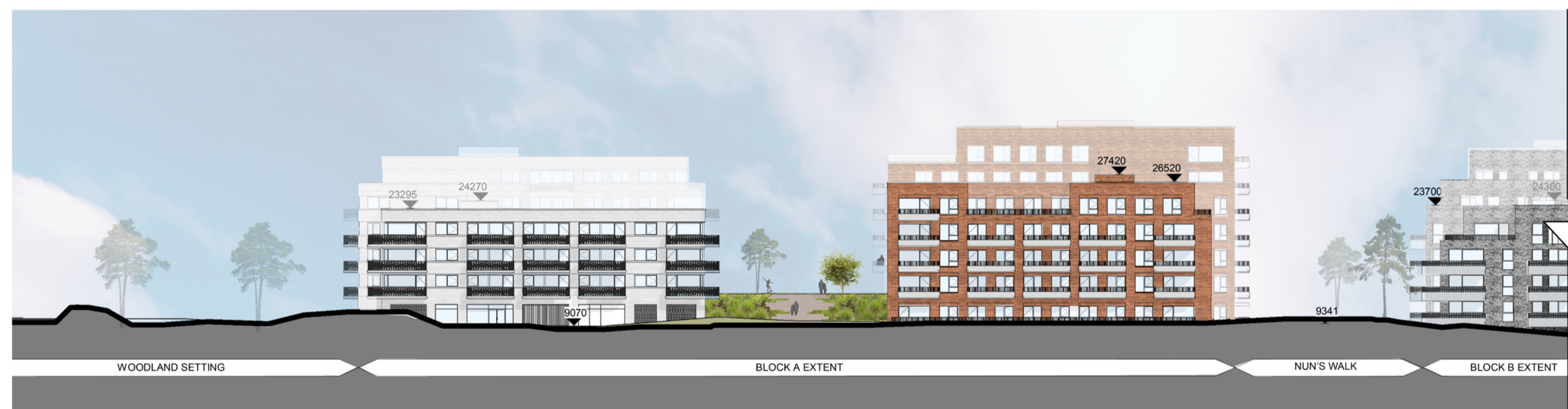
Site-Wide Elevation 03A