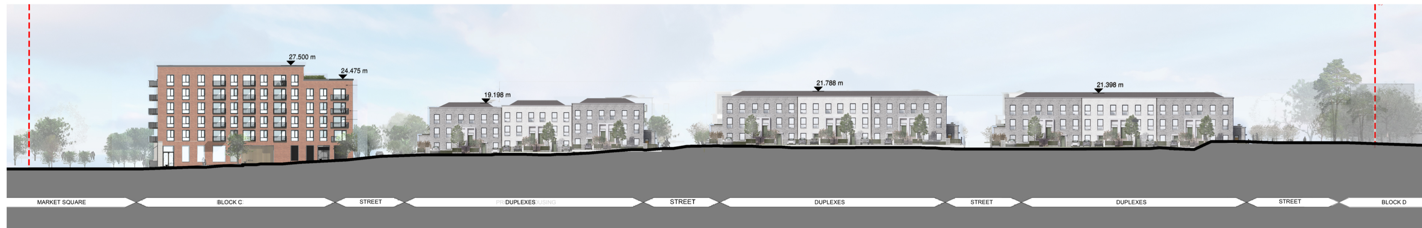
Site-Wide Elevation 02