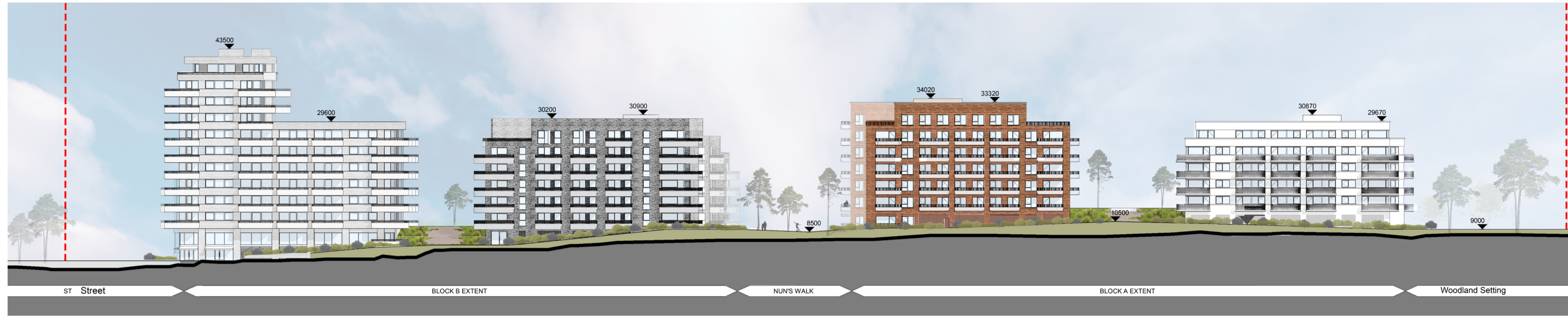
Site-Wide Elevation 01